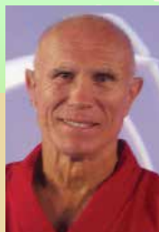
Bill Wallace Grandmaster 'Superfoot' Kick/Stretch